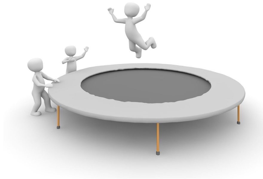
Bouncing on a trampoline

Describe Newton's third law (the action and reaction) in the 3 examples