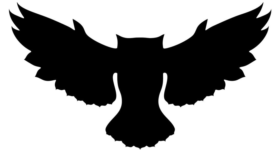
An owl flying